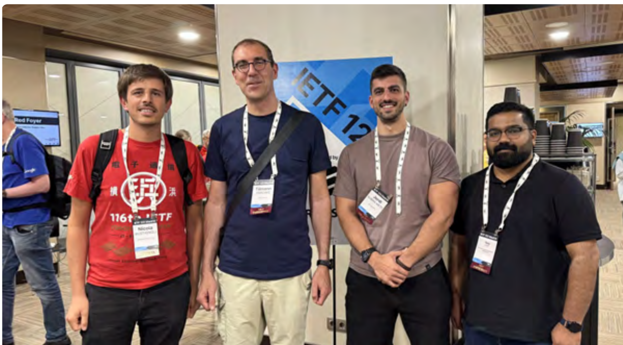
SCION Association, ETH Zurich, and Otto von Guericke University Magdeburg at IETF 123 in Madrid.

The SCION Association also represents the SCION community at the Internet Engineering Task Force (IETF) and Internet Research Task Force (IRTF). In 2025, work continued on the core protocol specification which had been submitted as three Internet Drafts (specifying the PKI, Control Plane, and Data Plane) through the Independent Submission process.