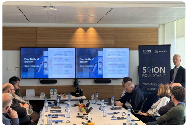
SCION roundtable in Amsterdam