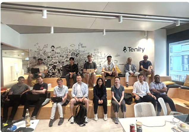
SCION Hackathon 2025

In addition, the first-ever SCION Hackathon was held on 18 June 2025. This brought a number of SCION developers together in Zurich to work on a number of new features including adding path awareness to gaming SDKs, improving the control plane beaconing process, developing an install mechanism for SCION end hosts, and extending the tutorials to support SCION IP Gateways.