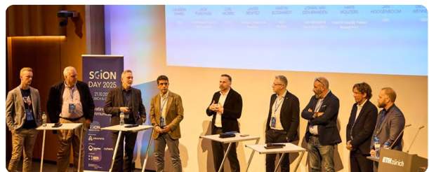
SCION DAY 2025 in Zurich