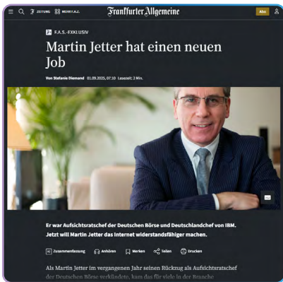
Fra nkrfurter Allgemeine Zeitung