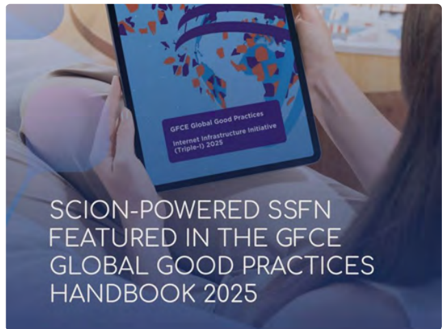
SSFN in the Internet Infrastructure Initiative (Triple-I) Handbook 2025

The Global Forum on Cyber Expertise (GFCE) is a multi-stakeholder community of over 260 governments, international organizations, and companies around the world. The latest edition of its Triple-I Handbook - a practical guide to cybersecurity aimed at governments, policymakers, regulators, ISPs, technical operators, and civil society - included a chapter about SCION and a case study of SSFN.