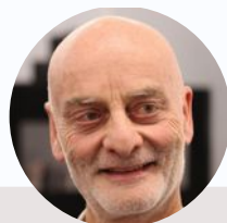
DR. ULI SIGG